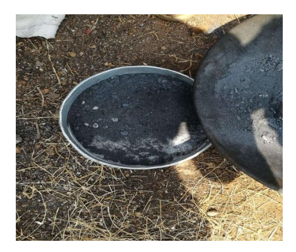
Ash of Cashew Nut Shells