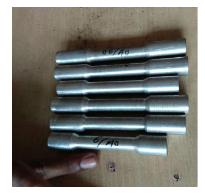
Tensile Test Specimens